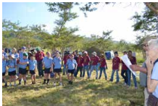
1st Vryheid excited about doing their mapping badge